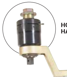
HG HAND MULTIPLIER Ideal tool where air and electricity aren't easily accessible. Page 01.10