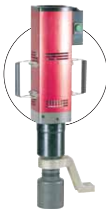
EF-SERIES INLINE MULTIPLIER with built-in controller Page 01.5 & 01.6