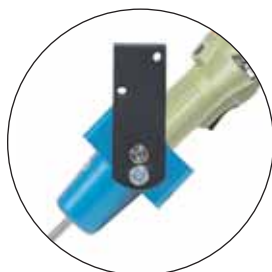
Under Table Mount