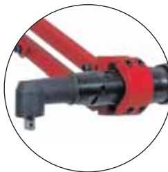
Angle Driver Clamp