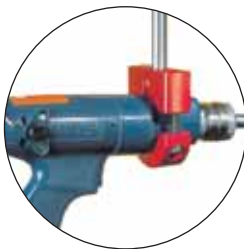
Pistol Grip Clamp