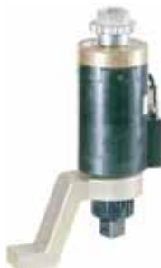
HSD Hand Multiplier Sensor Controlled