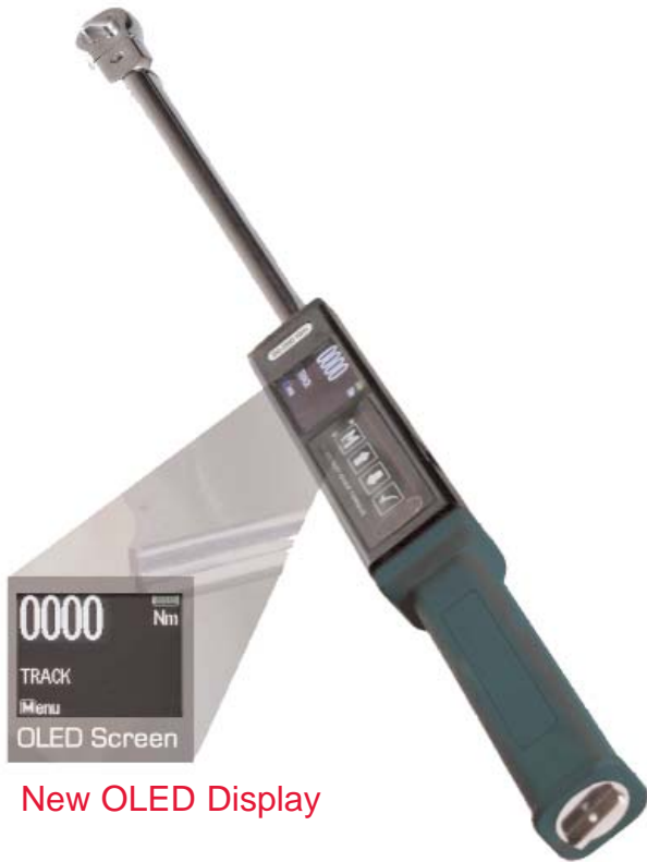
New OLED Display

The TorqueMate electronic torque wrench ensures product quality, cost savings and a reduction in overall production failures through complete monitoring of the fastening and assembly process with full data collection of the measured values.