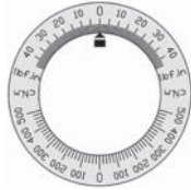
American & S.I. scales