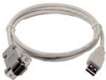
Cable 6 ft. (RS232 to USB Type A) Item: # 145780