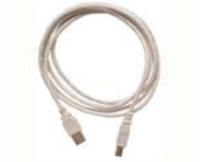
USB cable for connecting Controller to PC. Item: # 770319