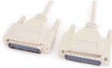
Cable 25 Pin I/O (Male-Male) Item: # 145760