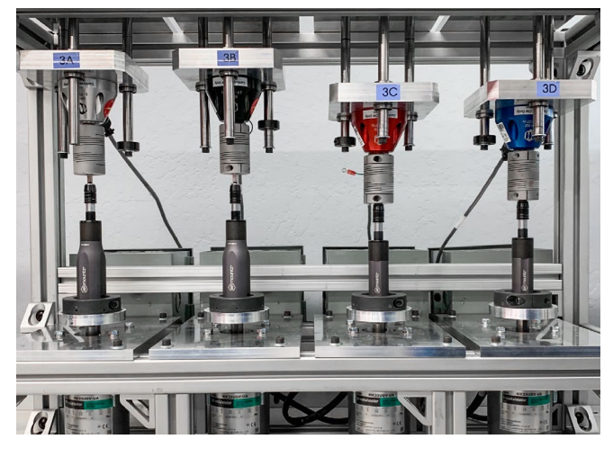
Mountz C_{\mbox{\scriptsize mk}} precision, accuracy, and lifecycle testing station.